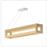
LP32942-WK White Oak